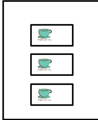
3 of your final business cards