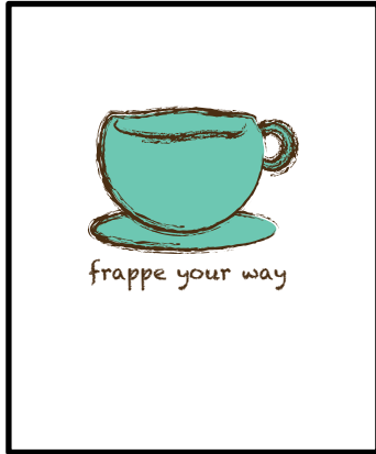
Your finished logo in color